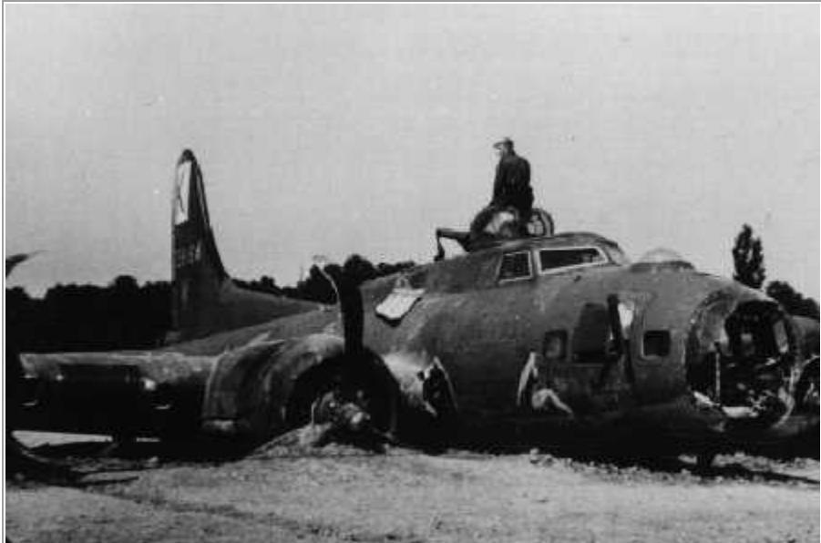
Photo taken after May 12 1944 crash landing near Angolsheim, Germany.