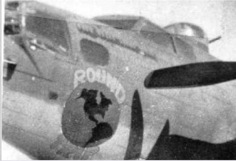
Photo approx. April 1944, based on 20 missions shown; crash landed during takeoff on January 6, 1945; referred to in Engineering report as "camera and weather ship."