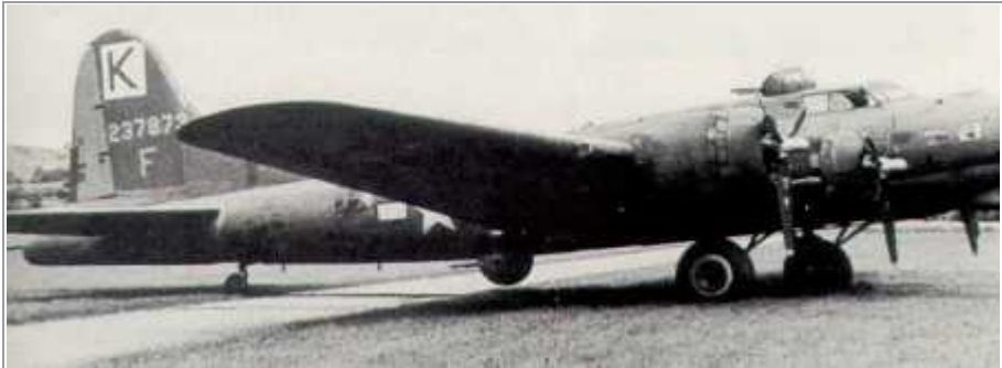
Photo July 13, 1944 at Dubendorf, Switz. Forced landing at Dubendorf on July 11, 1944. Aircraft and crew interned; subsequently scrapped at Kingman, Arizona in 1946.