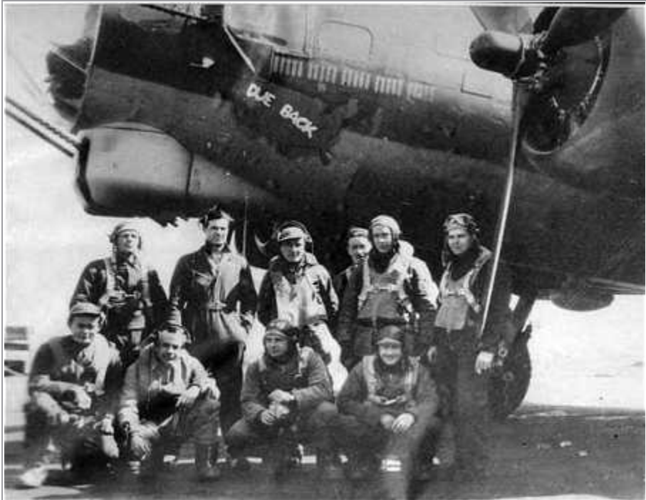
Photo taken at Rattlesden, sometime between November '43 and April '44 with an unidentified crew. Due Back was lost on April 29, 1944.