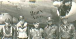
Photo between June and November, 1944 Lost over Merseburg on November 2, 1944.

undated and unidentified crew with Quien Sabe