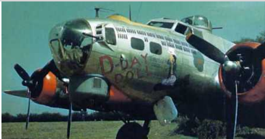
Photo taken during 1945 at Rattlesden Scrapped at Kingman, Arizona in 1946.