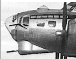
Photo between July 1944 and March 1945, to be established by mission count.