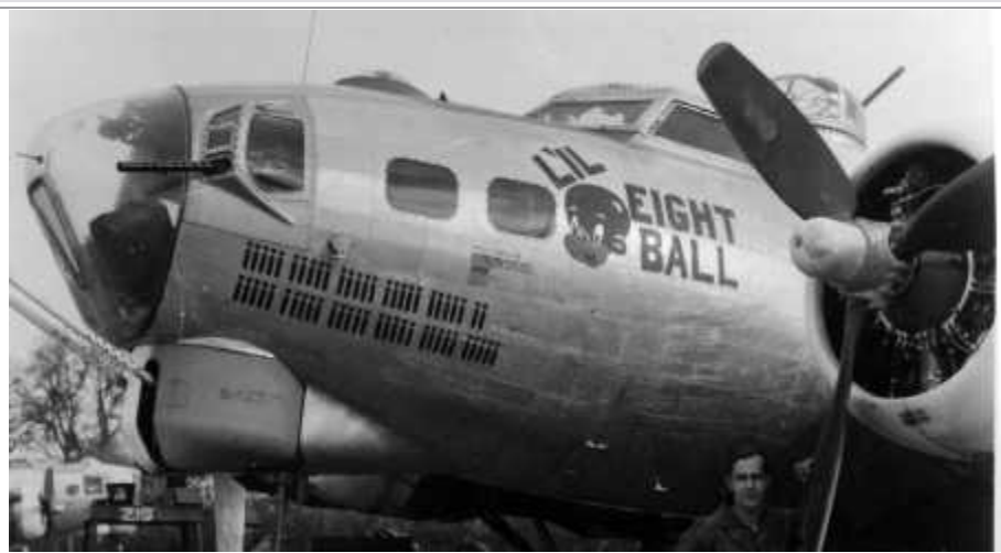
Photo after November 1944, based on 57 missions shown. Scrapped in 1946, possibly at Kingman, Arizona.