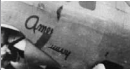
Nose art after repairs from 1/45 crash landing

Photo between July and September, 1944 Crash-landed at base in January 1945, but repaired and flown through April. Scrapped at Kingman, Arizona in 1946.