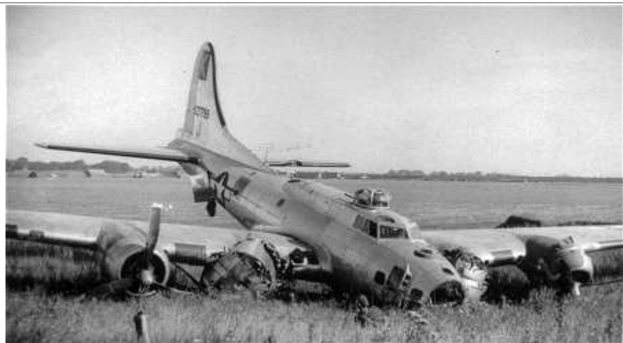
Photo July 8, 1944 Repaired and possibly transferred to the 96th Bomb Group after this wheels-up landing, but date uncertain.